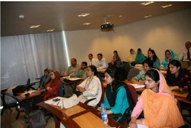
Participants during Lecture