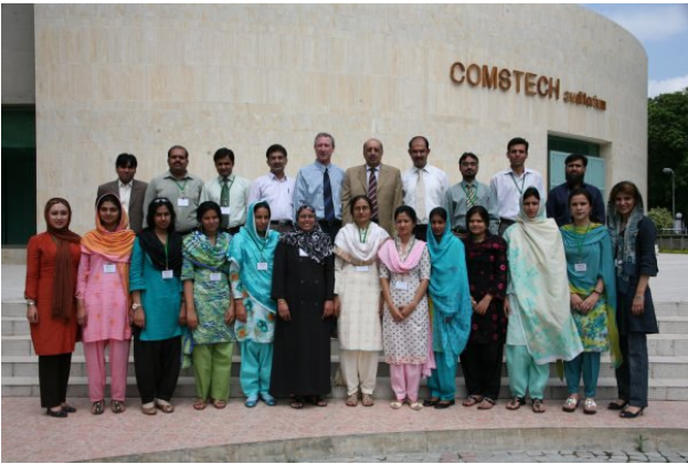
Guest and Participants