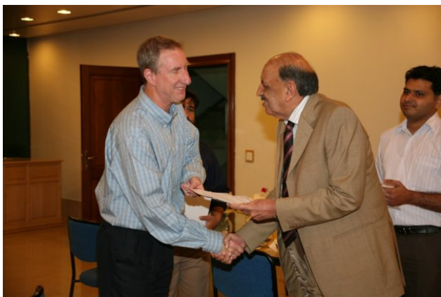
Certificate distribution ceremony